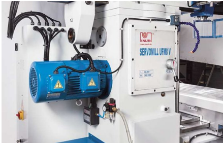
Powerful drive for horizontal spindle