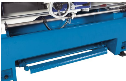
Adjustable stop cams automatically shut off the feed