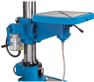
Drill table with motorized height adjustment