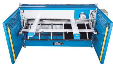
The pneumatic sheet hold-up device is reversible to control cutting either towards the front or towards the rear of the machine