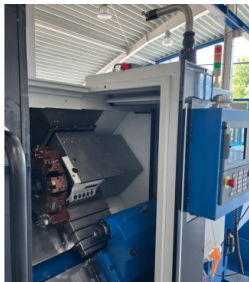
Separate stand provides secure support of the HPRC