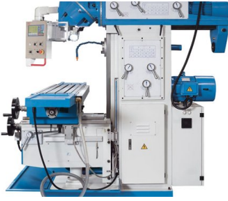
Large work area, cutter head swivels on 2 planes