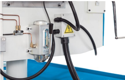
Manual central lubrication reduces maintenance and extends the machine life