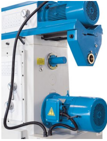
Horizontal spindle with its own drive and finely stepped gearbox