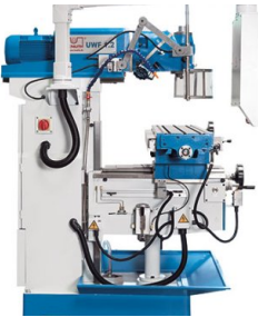
Large throat and long travels