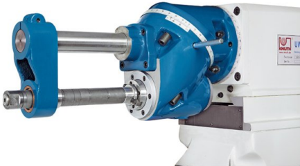
Horizontal cutter (standard equipment)

3-axis position indicator X.Pos 3.2 Outer arbor support for horizontal milling Milling chuck with collets 4,5,6,8,10,12,14,16 mm Long cutter arbor Ø 32 mm Coolant system LED work lamp Operator instructions