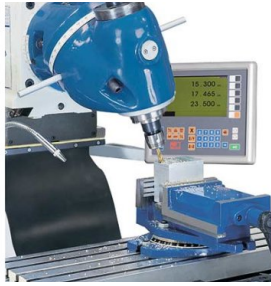
Cutter head swivels on 2 levels