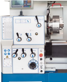
The extensive features of the X.Pos Position Indicator are complemented with a digital speed indicator and an easy to program auxiliary function