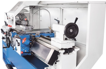
The tailstock can be repositioning for conical turning