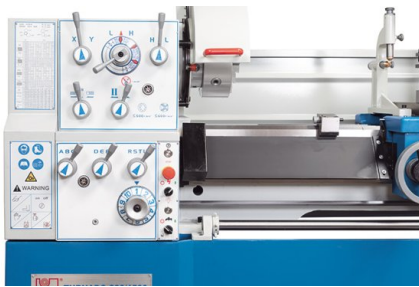
The user-friendly control panel at the headstock facilitates rapid user familiarization and intuitive operation