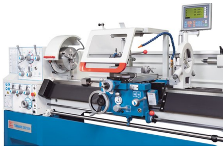
The large, swiveling safety cover at the support protects the user and keeps the work space clean