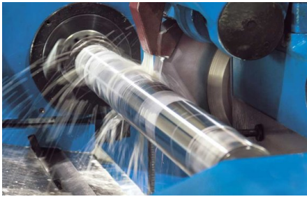
Wet grinding with rotating part