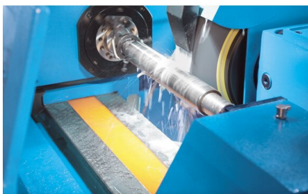
The hydraulic linear feed is infinitely variable and micro-adjustable