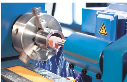
The maximum inside grinding diameter is 3.94"