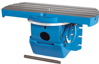
Universal swivel table for FPK 4.3/ FPK 6.3 (253721)