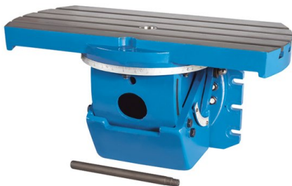
Universal swivel table for FPK 4.3/ FPK 6.3 (253721)