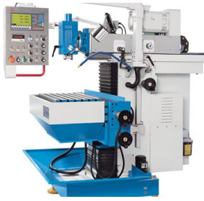
All operator controls are arranged on one side