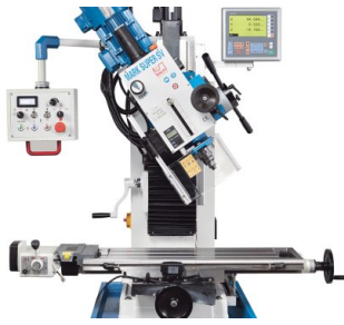
Head swivels \pm 45^\circ