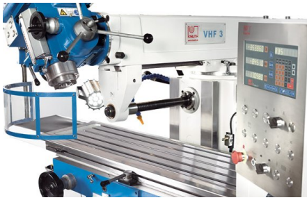
Horizontal milling spindle with outer arbor support for long milling arbors