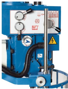
Automatic 3-step quill feed