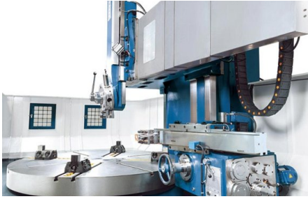
Vertical support includes a 5-station tool holder, side support with independent feed for inside and outside turning