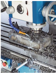
Face milling with cutter head