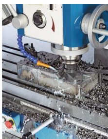
Face milling with cutter head