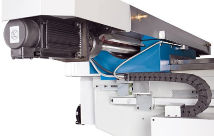
High precision ball-screws