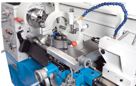
High-quality quick-change tool holder with 0.01 mm repeatability