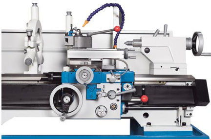
Model is equipped with integrated central lubrication at the support for low maintenance