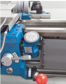
The thread gauge allows for resuming the thread after the apron nut for retrograde motion has been opened