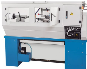
The work area is also accessible through large swinging doors on the back of the machine