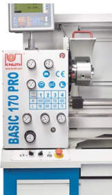
The operator elements are very clearly organized