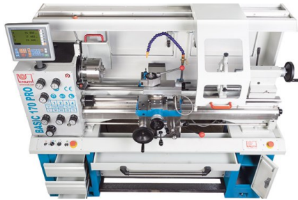
The machine base features ample storage space for accessories and tools, including a chip tray that can be removed at front