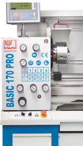
The operator elements are very clearly organized