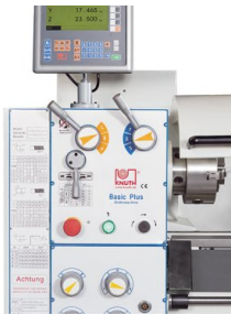
Positioning indicator on X, Z and Z1 axis