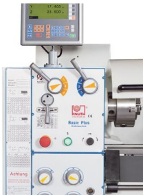
Positioning indicator on X, Z and Z1 axis