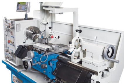
Steady and follow rests are included