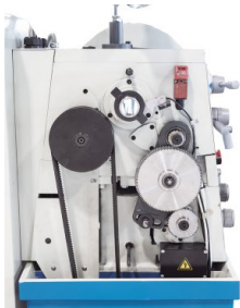
Change gears provide for a wide range of thread leads and feeds