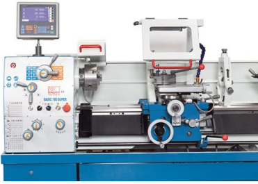
Select the optimum spindle speed for the Basic 180 Super via its 16-step main drive