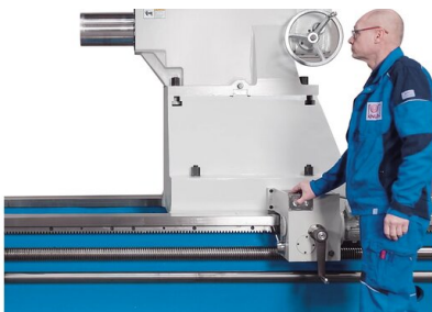
Motorized positioning of tailstock (all models with a minimum center width of 118")