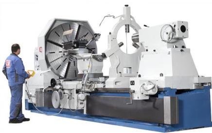
A compact hand-held main spindle control is included to provide full control over the process during complex machining operations