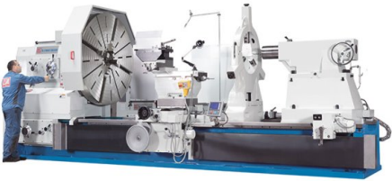
21-step gears ensure high torque across the entire precision-stepped speed range starting at 2 rpm.