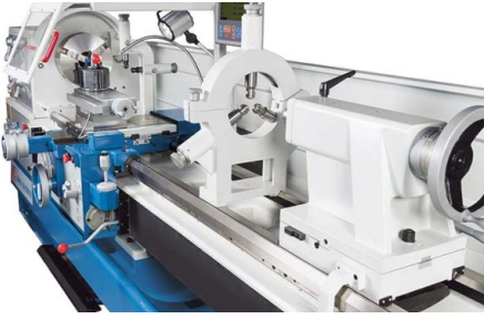
Rests ensure maximum precision when machining long workpieces