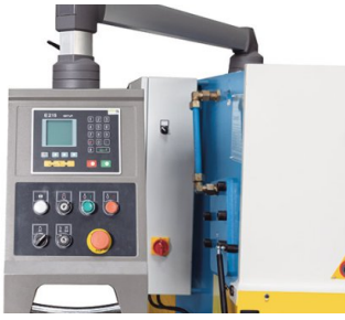
NC control for quick positioning of the back gauge