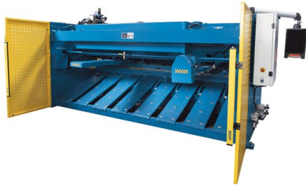
With the pneumatically controlled plate hold-up fixture even thin metal sheets can be positioned with high accuracy at the back gauge