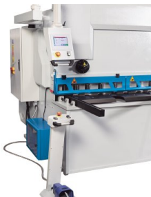
CybTouch 8 G is a powerful control that perfectly complements premium plate shears