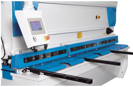
Modern design, with large work table and powerful CybTouch 8 G controller