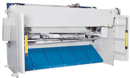
Light curtain system at the rear for additional protection