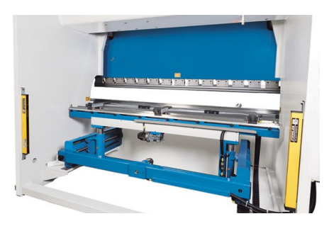
The machines in this series can be retrofitted with a controlled back gauge system with R-axis