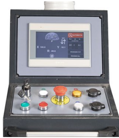
Intuitive controller with large touchscreen and three operating modes: manual/semi-auto/automatic