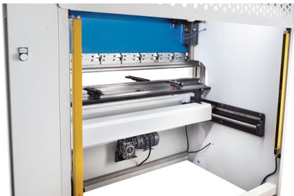
The rear side is protected by light curtains