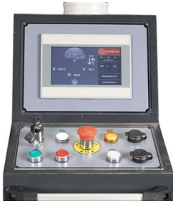
Intuitive controller with large touchscreen and three operating modes: manual/semi-auto/automatic