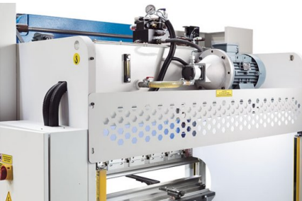
Hydraulic unit positioned on the top of the machine for extra bending space.