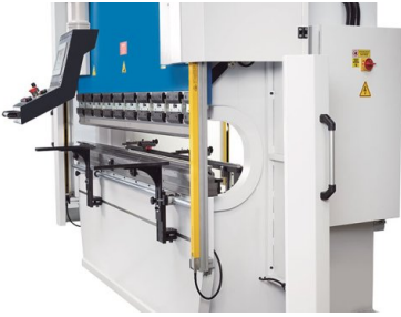
A large throat and narrow table to ensure plenty of free space for complex bending