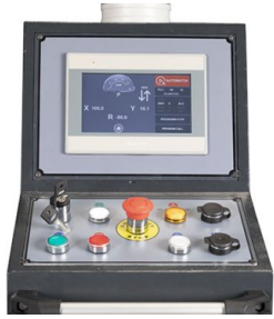
Intuitive controller with large touchscreen and three operating modes: manual/semi-auto/automatic