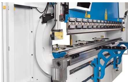
The optional motorized crowning allows quick compensation for workpiece deviations during the bending process