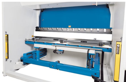
The machines in this series can be retrofitted with a controlled back gauge system with R-axis