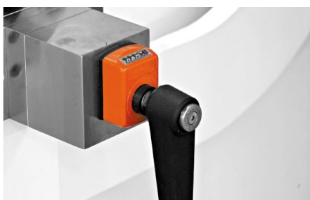
All machines include a manual crowning system inside the table. Motorized crowning is available as optional feature