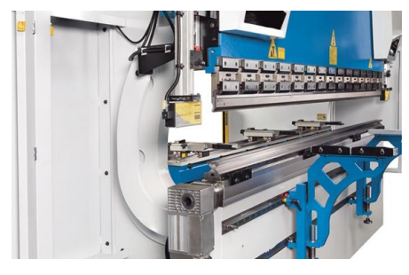
The optional motorized crowning allows quick compensation for workpiece deviations during the bending process