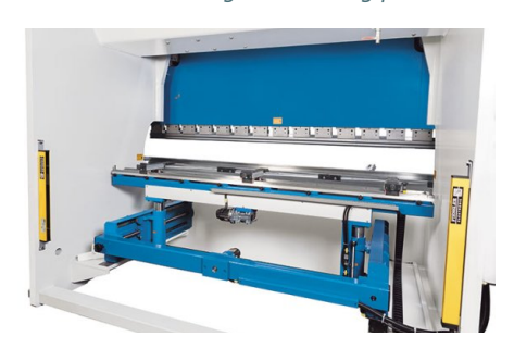
The machines in this series can be retrofitted with a controlled back gauge system with R-axis