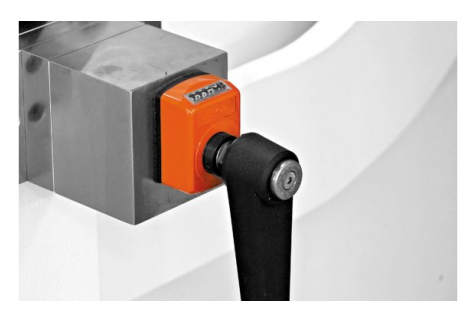
All machines include a manual crowning system inside the table. Motorized crowning is available as optional feature