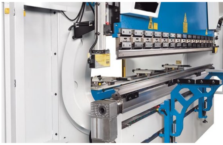
The optional motorized crowning allows quick compensation for workpiece deviations during the bending process