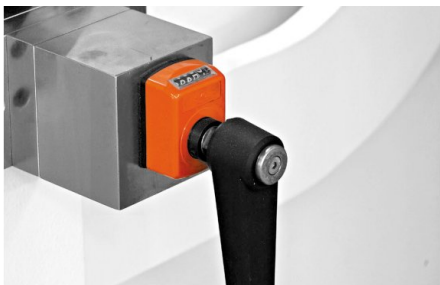
All machines include a manual crowning system inside the table. Motorized crowning is available as optional feature