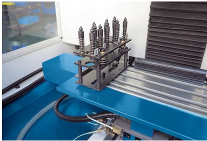
Tool holder with 4 positions