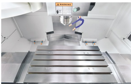
Solid machine table with 5 slots