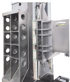
Cast iron body with large span