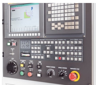
Control Fanuc Oi-MF