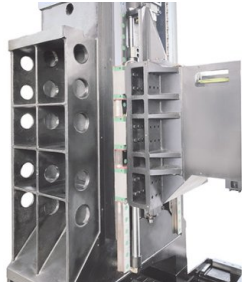
Cast iron body with large span