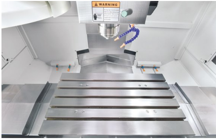
Solid machine table with 5 slots