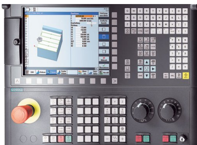
Control Siemens Sinumerik 828D