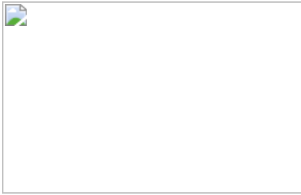
Solid machine table with 5 slots