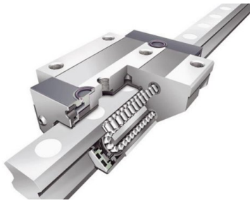
Linear-roller guides for super quiet operation