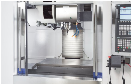
Wide opening front doors