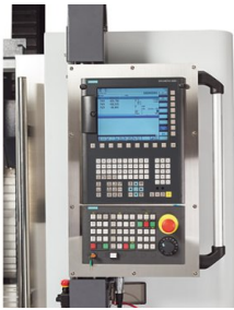
Siemens Sinumerik 828D with ShopMill