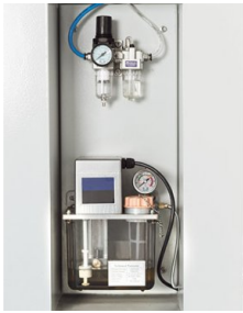
Central lubrication device and maintenance unit