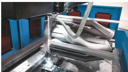
In additive production (3D-Printing) the produced complex parts are attached to a metal plate, where the metal plate subsequently will have to be separated from the component (Neospark 500 B Continental Engineering Services)