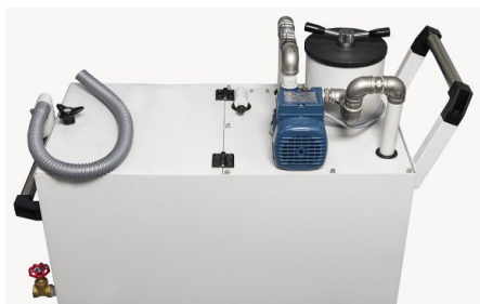
Dielectric tank with double filtration system