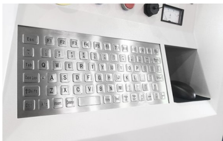
Stainless steel waterproof keyboard