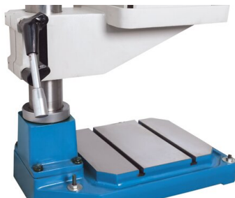
Large base plate with parallel clamping slots for large workpieces