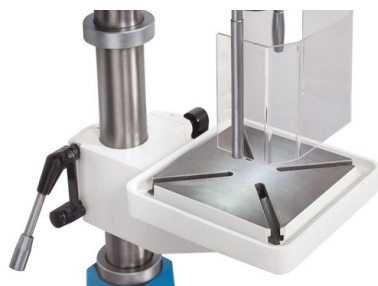
Large square work table with diagonal flutes