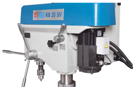
AC servo motors deliver high torque at low speeds