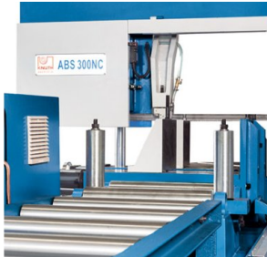
Standard roller conveyor extends the integrated material support area